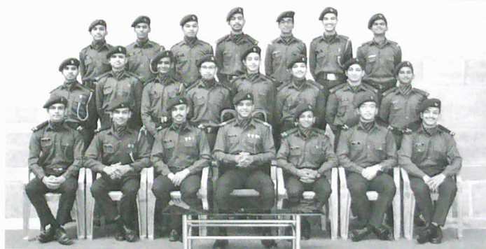
184 th 'KNIGHTS' IN SHINING ARMOUR

couldn't imagine doing, in the PT Fields and the X-Country Run, the Boxing Ring and the Athletics Track. Our growth as a Cadet was phenomenal with every passing Term - Cadet Guardians, Section Parade Staters, 'Pillars of Section' in Classes IV and IVA, and obviously, the 'Senior Cadets' in Classes V and VA.